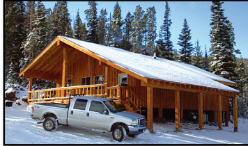
Spike Camp 1/Shoe Box