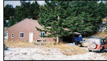
Spike Camp 2/Divide Creek