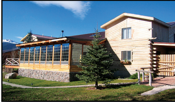
Base Camp/Main Lodge